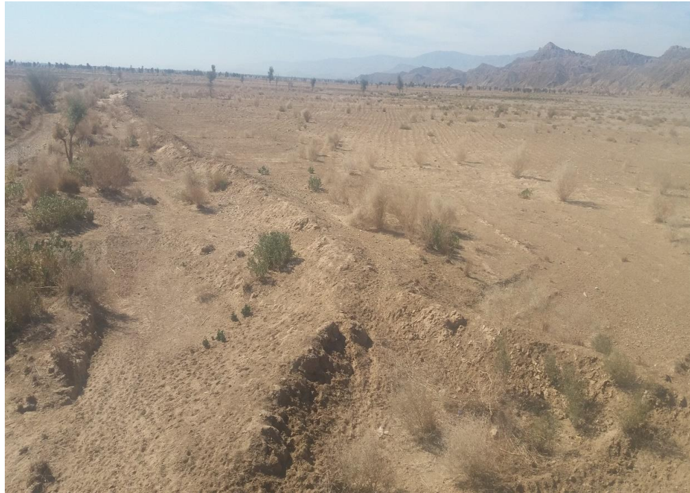
DREAM II Learning Event 1 - The Rangeland Fodder Nexus