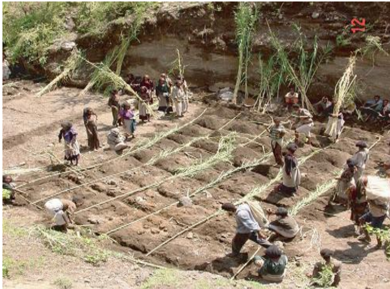
Photo 2: Planting of elephant grass by layering to rehabilitate gully bed

Layering is the horizontal planting of fresh stems of plants (e.g. elephant and bana grass, green gold, spanish reed, elderberry, poplar, willow) across the gully floor and/or reshaped sidewall, or at the base of gully walls. This technique is applied when a satisfactory level of sedimentation has been achieved. The stems of these plants root very easily and initiate shoot quickly. Sedimentation increased as the shoot growth forms a dense barrier that checks and breaks the flow of water. This in turn leads to a gradual build-up of the gully floor/bed as a result of siltation.