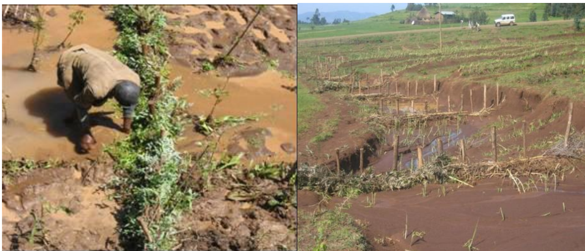
Photo 1: Sample photos on biological gully rehabilitation practices using wattle techniques

Reinforced bundling requires that mature poplar or willow stems or truncheons (branches), 70 cm in length, are inserted 20 cm deep next to each other across the gully floor or bed in two rows, spaced 50 cm apart. Downstream buttressing (support) should be provided for stability. The space between the two rows of truncheons should then be filled with bundles consisting of approximately 30% vegetative (fresh) bundles of planting material, and 70% of filling material. Withering of the planting material can be prevented by lightly covering the material with moist soil. As soon as the poplar or willow stems have exhibited adequate vertical growth, the space between the stems can again be filled with bundling material. There will thus be an incremental growth in the height of the structure, which will in turn add to the level and amount of siltation. This technique should only be applied when the rainy season has commenced. Through time, the bundles grow and serve as live check dams (photo 1). Bundles of willow, popular, green gold, bana and elephant grass species are simple and effective means's to control small sized gullies.