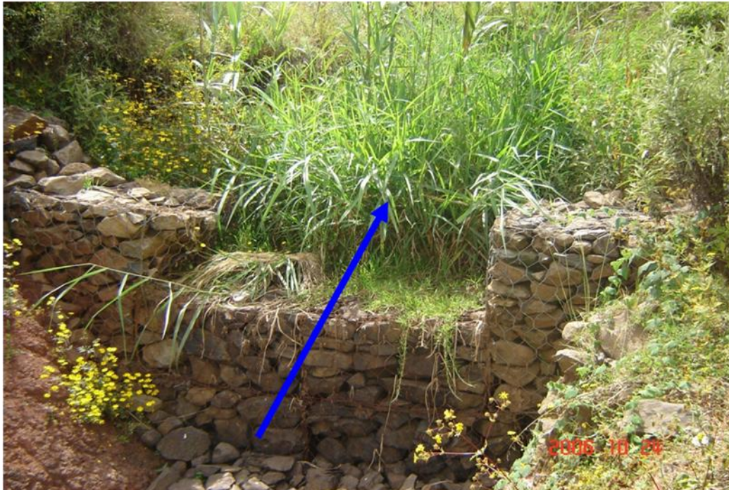
Green gold behind the Gabion checkdam